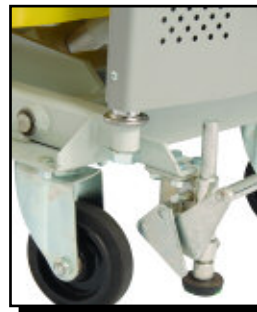
Smooth rolling casters and floor lock