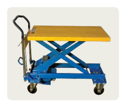
Medium-Duty: Model A-500