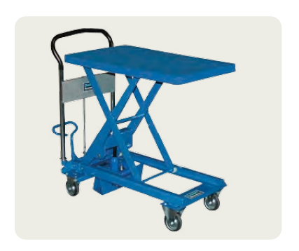
Light-Duty: Model L-150