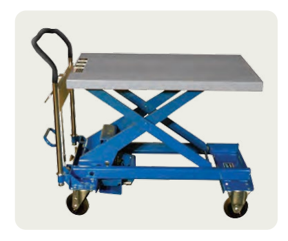
Heavy-Duty: Model A-800