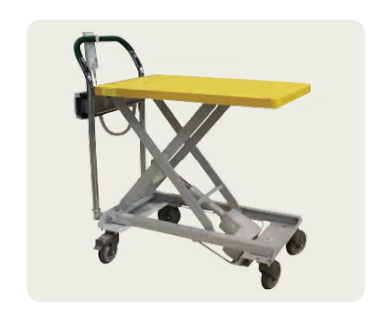
PLM-250 - Tethered Remote Control Standard