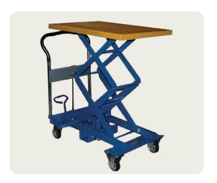
Medium-Duty/High-Lift: Model A-350W