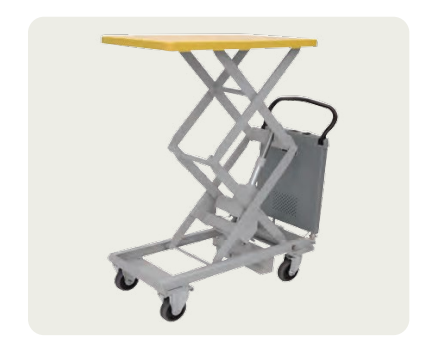
PLM-100 / PLM-100W