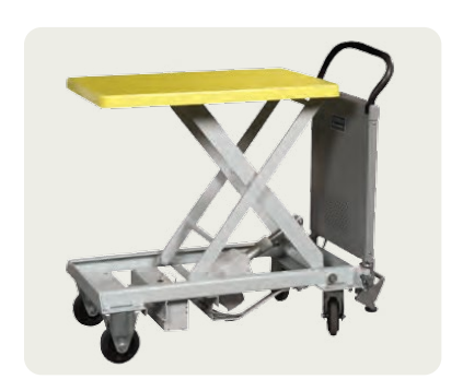
PLM-150 / PLM-150W