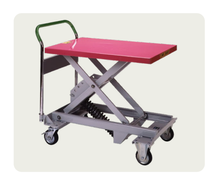
Auto Leveling - Dandy Leveler: Models DLV-150 and DLV-500