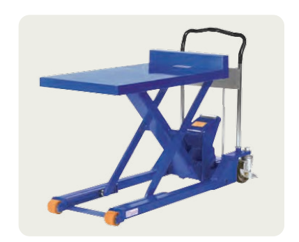
Pallet/Skid Lifter Transporter: Model M-500L