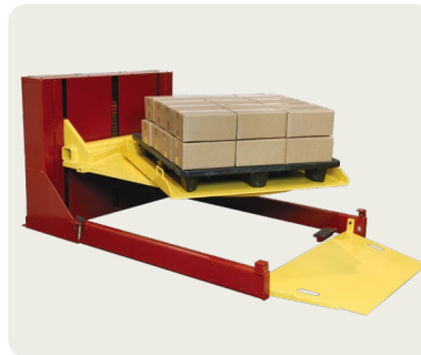
Model Roll-C with Turntable