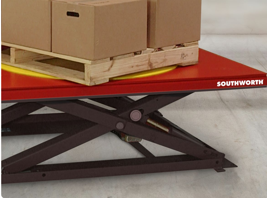
LiftMat Lift Table with Turntable